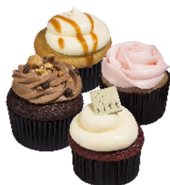
Sift 杯子蛋糕4件 （價值：HK$128）