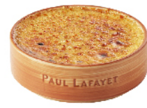
PAUL LAFAYET 法式焦糖燉蛋1件 （價值：HK$50）

成功登記「9月開心簽賬密密送」推廣計劃及憑卡累積簽賬滿指定金額，即可享高達HK$438獎賞！