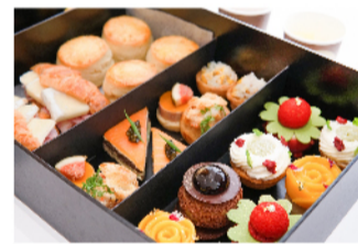
Grand Hyatt Hong Kong Tiffin Takeaway Afternoon Tea Set 26 pcs (value: HK$438)