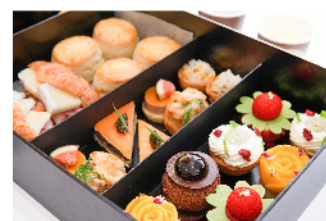
君悅酒店茶園 外賣下午茶26件裝 （價值：HK$438）