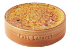
PAUL LAFAYET Crème Brûlée 1 pc (value: HK$50)

Register successfully for "September Spending Rewards" programme and reach our set spending amount to receive rewards worth up to HK$438!