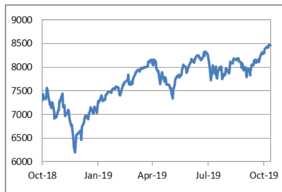
NASDAQ Composite Index