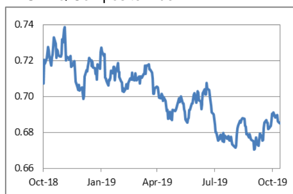
AUD/USD Daily Chart