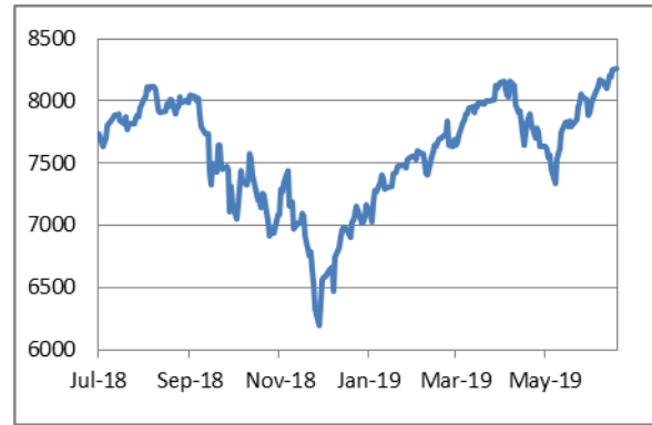
NASDAQ Composite Index