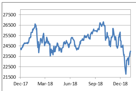
Dow Jones Industrial Average