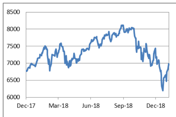
NASDAQ Composite Index