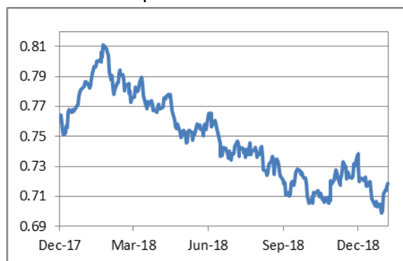
AUD/USD Daily Chart