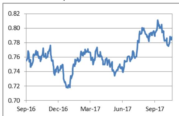
AUD/USD Daily Chart