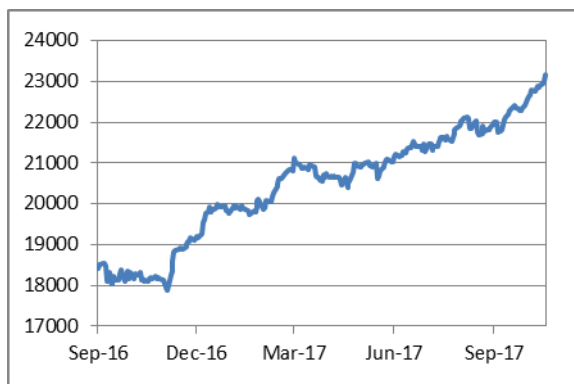
Dow Jones Industrial Average