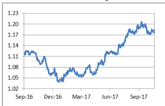
EUR/USD Daily Chart