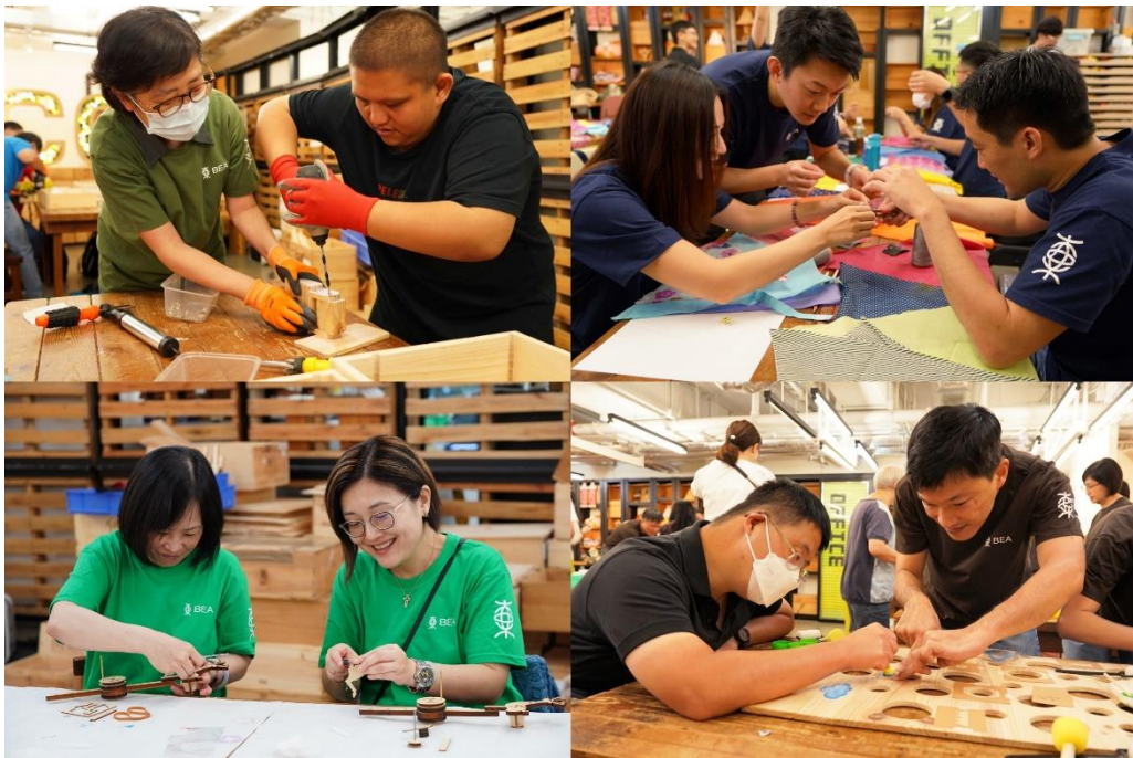
Persons with disabilities and BEA volunteers applied their creativity to transform recycled materials into exhibits and toys.