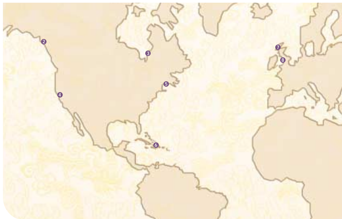
東亞銀行約 160 個營業地點服務全球客戶。

東亞銀行一直緊貼市場情況，以滿足客戶不斷轉變的需求，服務範圍包括企業銀行、個人銀行、投資銀行及中國業務。本行提供全面的零售及批發銀行服務和產品，包括存款、外幣儲蓄、樓宇按揭貸款、私人貸款、信用卡產品、電子網絡銀行服務、強制性公積金服務、貿易融資、銀團貸款、匯款及外匯孖展交易等。東亞銀行將持續服務香港、中國及海外客戶，致力提高其作為香港主要金融機構之一的地位。