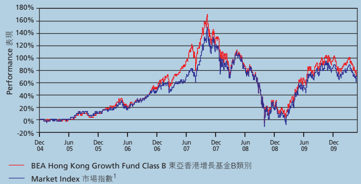
— BEA Hong Kong Growth Fund Class B 東亞香港增長基金B類別 — Market Index 市場指數 1

Source: BEA Union Investment Management Limited as at 31 st May, 2010. 資料來源：東亞聯豐投資管理有限公司截至2010年5月31日之數據。