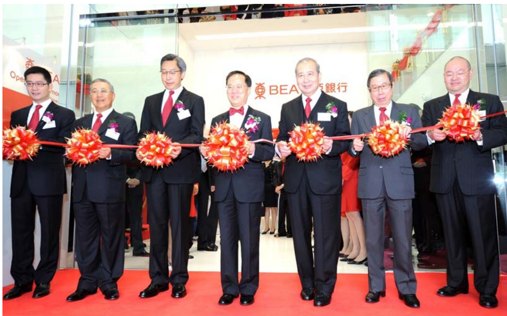
Caption: Pictured at the ribbon-cutting ceremony were: (fourth from left) The Honourable Donald Tsang, (third from right) Dr. David K.P. Li, Directors and Senior Management of BEA.