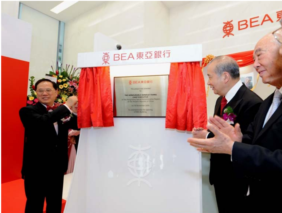
Caption: (Left) The Honourable Donald Tsang, GBM, Chief Executive of the Hong Kong Special Administrative Region unveiled the commemorative plaque for the new BEA Building.